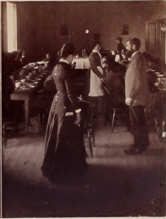
Indian School at Albuquerque, New Mexico.